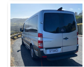
Mercedes 12 seater Sprinter