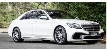
Mercedes S63 AMG