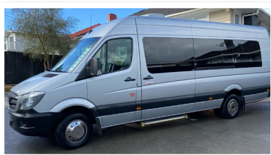
Mercedes 15 seater Sprinter